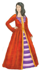
Dress 10 Gold Coins

2. Draw a circle round each of the gifts Jacob would be able to buy for Hannah with his spare money.